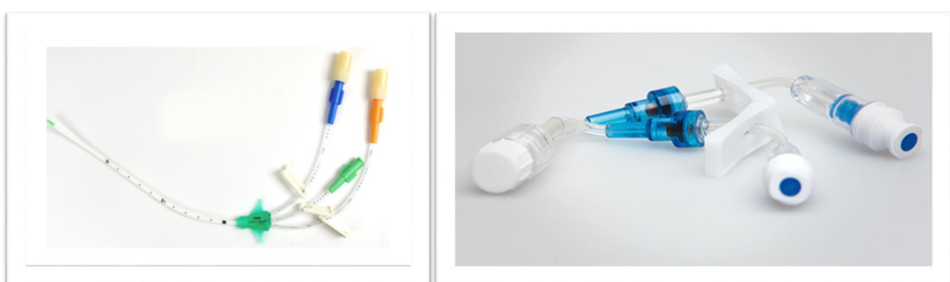
Figure 1. Triple lumen central catheter (left) and a Y-site connector (right)