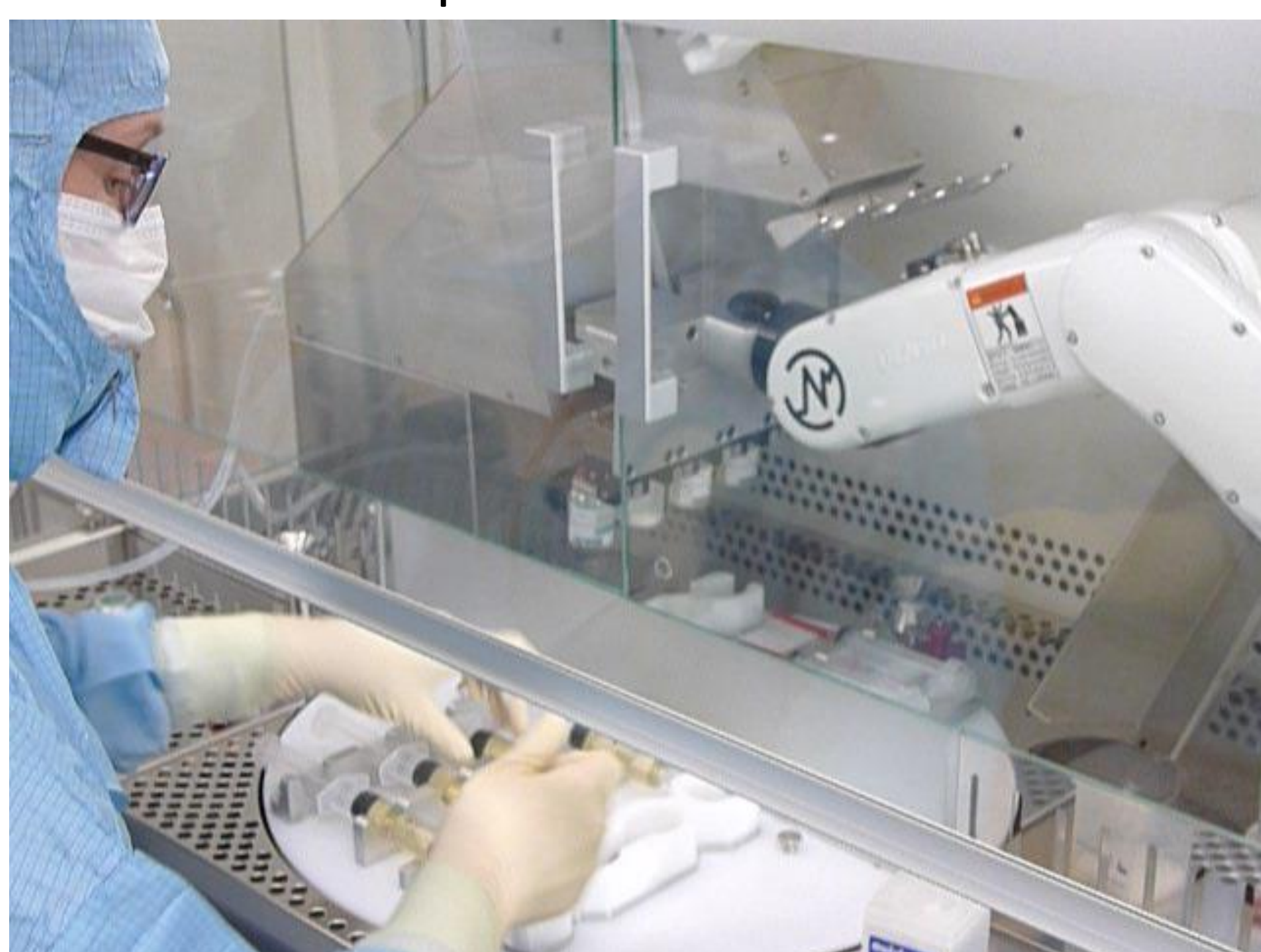
Figures 1 and 2. IV Icon Basic® (Newicon Oy) reconstituted cefuroxime injections. Filled syringes were closed manually. Over 40 000 RTA-syringes were reconstituted in Kuopio University Hospital on 2017.

To determine the physicochemical stability of cefuroxime 80mg/ml solution in polypropylene syringes to establish the shelf-life of the product.